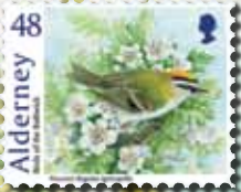
Alderney Bailiwick Birds