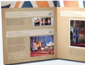
Limited Edition Folder £14.99

We're also thrilled to offer collectors a fabulous limited edition commemorative Royal Wedding folder which includes a complete set of all the Royal Wedding stamps produced by Guernsey Post.