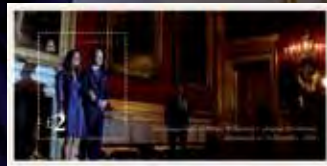
Royal Wedding, Prince William and Catherine