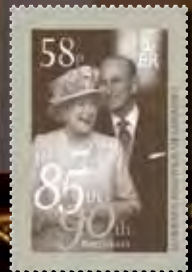
Queen Elizabeth 85th and Prince Philip's 90th